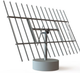
DEGERtracker D80 (1)