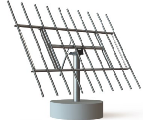
DEGERtracker D100 (1)