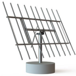
DEGERtracker D60H (1)